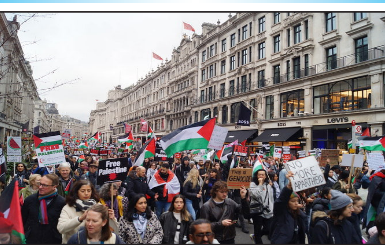
Thousands of pro-Palestinian protesters attended the eighth national march for Palestine in London on Feb. 3, 2024.

LONDON (Dispatches) - Thousands of pro-Palestinian demonstrators marched through the streets of London to "condemn UK government actions" in the war on Gaza and call for an immediate ceasefire, organizers said.