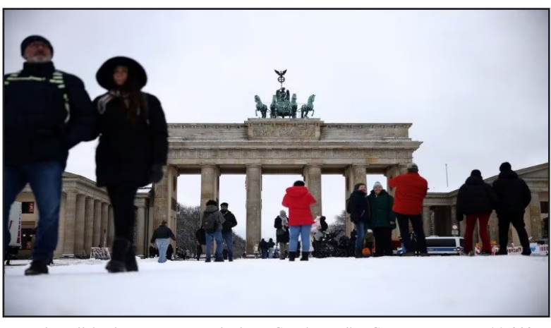
People walk in the snow at Brandenburg Gate in Berlin, Germany January 16, 2024.

FRANKFURT/OSLO (Reuters) -Freezing rain in central and southern Germany grounded hundreds of flights and disrupted train travel on Wednesday, while heavy snowfall in Norway's capital led to the temporary closure of its main airport.