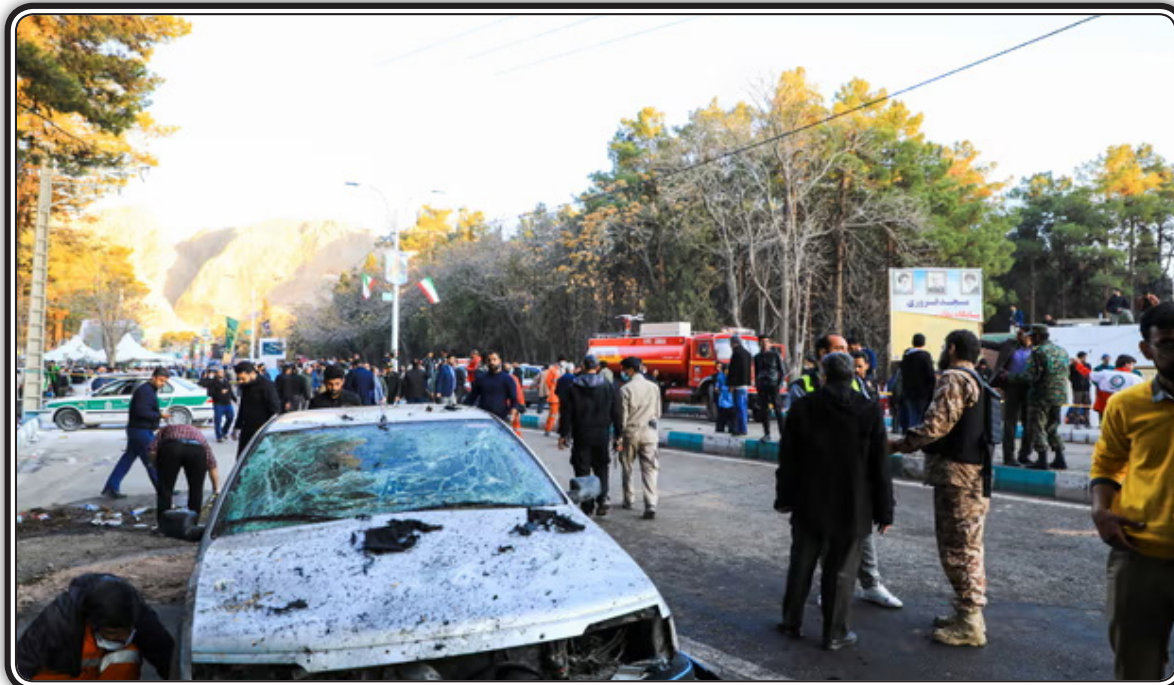
Explosions killed scores of people during a commemoration near the grave of Iran's anti-terror commander General Qassem Soleimani.

TEHRAN – Iranian security forces are going to make more arrests in connection with the January 3 terrorist attack in the southern city of Kerman, Interior Minister Ahmad Vahidi said Wednesday.