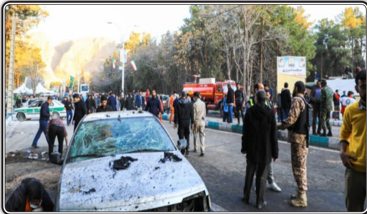
The explosions ripped through a crowded area in southeastern Iran's city of Kerman on Wednesday.

TEHRAN – Iran's Interior Minister Ahmad Vahidi said Friday some agents linked to Kerman terrorist attacks that left at least 89 people martyred and scores more injured have been arrested.