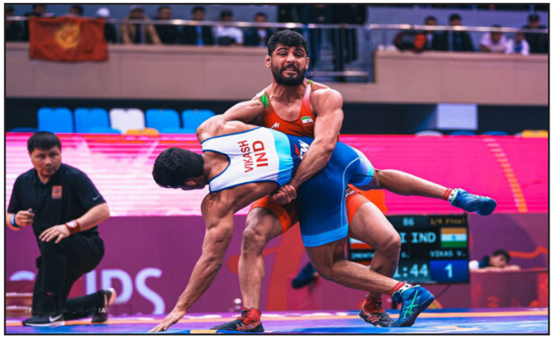
TEHRAN – Iranian Greco-Roman wrestlers won the title of the 2023 Asian Wrestling Championships in Kazakhstan on Monday.