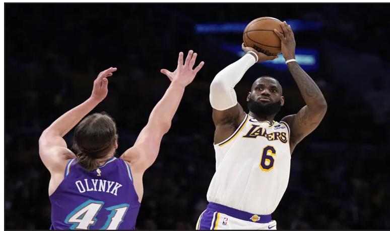
Los Angeles Lakers forward LeBron James, right, shoots as Utah Jazz forward Kelly Olynyk defends during the first half of an NBA basketball game Sunday, April 9, 2023, in Los Angeles.

get ready for the game." D'Angelo Russell had 17 points for the Lakers, who won nine of their last 11 games and went 18-9 after revamping their roster at the trade deadline. Los Angeles was six games under .500 as recently as Feb. 13 before finding its groove with the new players led by Russell, defense-minded starter Jarred Vanderbilt and outside shooter Malik Beasley. Russell will be facing the Timberwolves for the second time since they traded him at the deadline. "Not the fact that they traded me has anything to do with it, but the fact they're in the way of what we're trying to get done, that's all that really matters to me," Russell said. The Lakers never pulled away from the Jazz, who stayed within one possession down the stretch despite resting