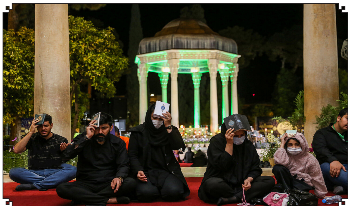
Worshippers hold prayers and vigil at the mausoleum of renowned Persian poet Hafez in Shiraz on the first night of Qadr coinciding with the assassination of Imam Ali (AS). Muslims believe that the Night of Qadr comes with blessings and mercy of God in abundance, sins are forgiven and supplications are accepted.