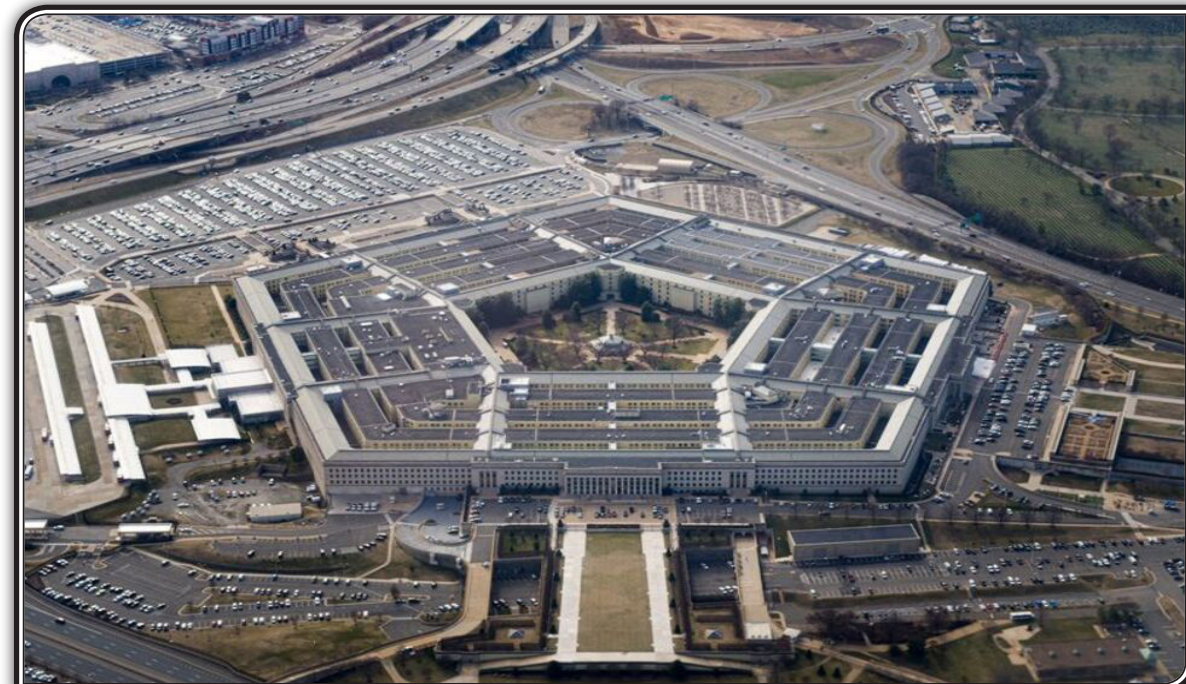
The Pentagon is seen from the air in Washington, March 3, 2022, more than a week after the Ukraine war began.

WASHINGTON (Reuters) -- The U.S. national security community is grappling with fallout from the release of dozens of secret documents, including the impact on sensitive information-sharing within the government and ties with other countries, two U.S. officials said.