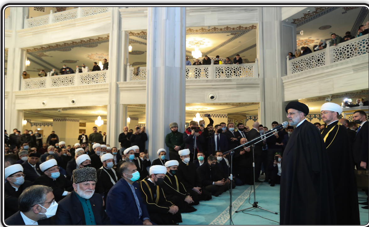
President Raisi addresses worshippers at a mosque in Moscow during an official visit to Russia in January 2022.

TEHRAN -- President Ebrahim Raisi said Monday leaders of Muslim countries should rely on the teachings of the Holy Qur'an and revere the spirituality of Ramadan in order to promote unity within the Muslim community during the sacred fasting month.