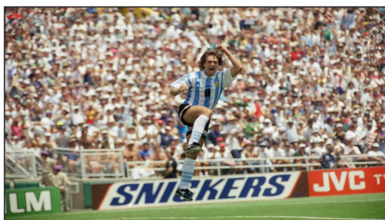
Argentina forward Gabriel Batistuta flies through the air in celebration after scoring a goal on a free penalty kick during the World Cup soccer championship second-round game against Romania at the Rose Bowl, July 3, 1994 in Pasadena, California.

"I expected him to be much calmer, but he is playing like a 20-year-old," he said. "And that's because he's hungry, he's here to win the Cup. That's what football needs, that's what Leo is spreading to the whole team."