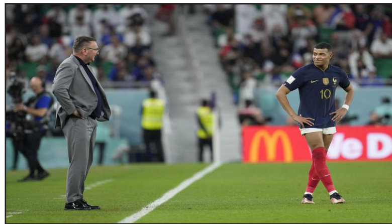
Poland's head coach Czeslaw Michniewicz looks across at France's Kylian Mbappe during the World Cup round of 16 soccer match between France and Poland, at the Al Thumama Stadium in Doha, Qatar, Dec 4, 2022.

"There is no recipe to stop Mbappe in the form that he's in now," Michniewicz told a news conference.