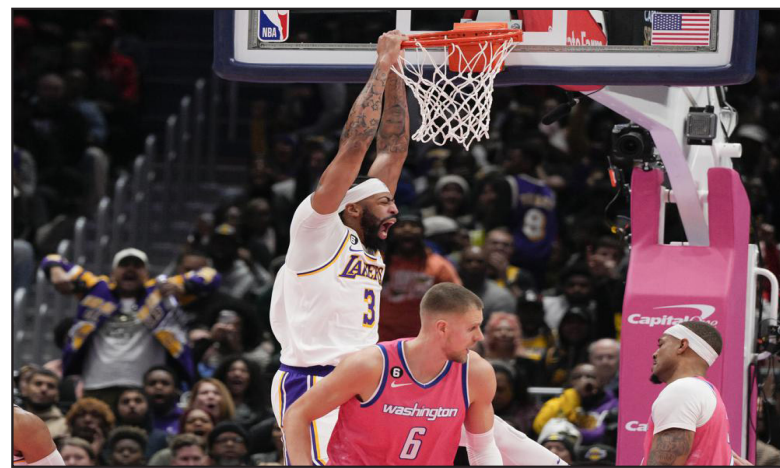
Los Angeles Lakers forward Anthony Davis, left, dunks against Washington Wizards centers Daniel Gafford (21) and Kristaps Porzingis (6) during the second half of an NBA basketball game, Sunday, Dec. 4, 2022, in Washington. The Lakers won 130-119.

WASHINGTON (AP) — Anthony Davis scored 55 points on sizzling 22 of 30 shooting and added 17 rebounds, leading the Los Angeles Lakers over the Washington Wizards 130-119 on Sunday night.