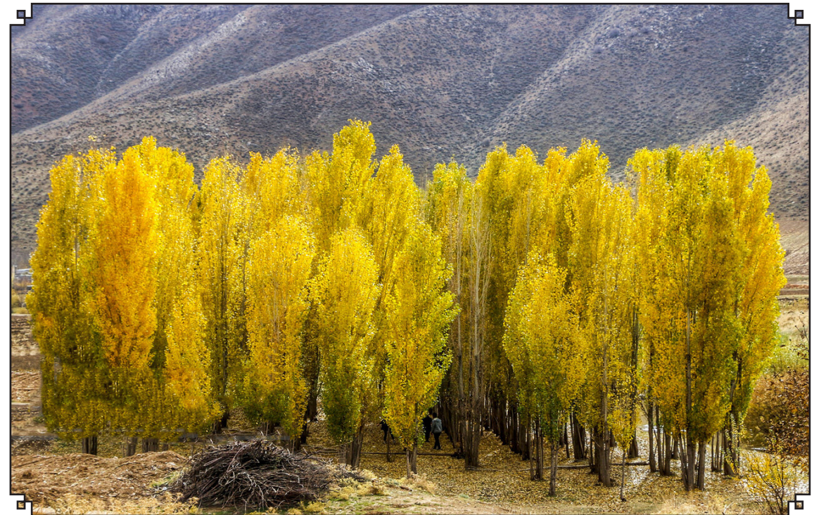
The beauty of the autumn season in the nature of Lorestan province, Iran.