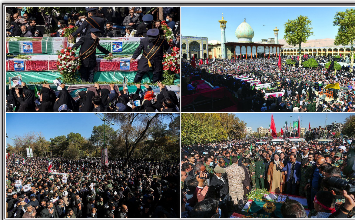
The first row of pictures shows Iranians attending funeral for victims of a terrorist attack on the holy shrine of Shah Cheragh in Shiraz on Oct. 29, 2022. The second row shows people taking part in a procession in Isfahan on Nov. 20, 2022 for three security forces martyred during riots.

TEHRAN – The Islamic Revolution Guards Corps (IRGC) on Monday hailed the judiciary for its firm dealing with a number of rioters affiliated with the Zionist spy agency, saying no mercy will be shown to rioters, thugs and terrorists serving the country's enemies.