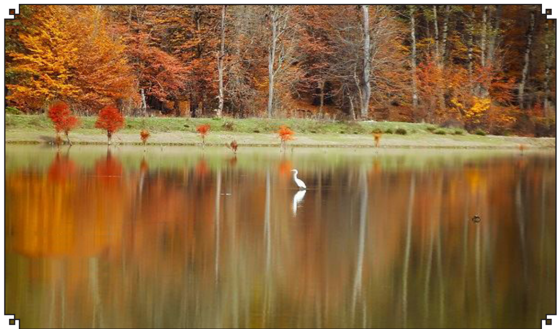
Mazandaran is a northern Iranian province that is renowned for its beautiful scenery and vibrant colors. The province is especially stunning in the autumn season, when the leaves of the trees change color and the landscape is blanketed in a sea of red, orange, and yellow.