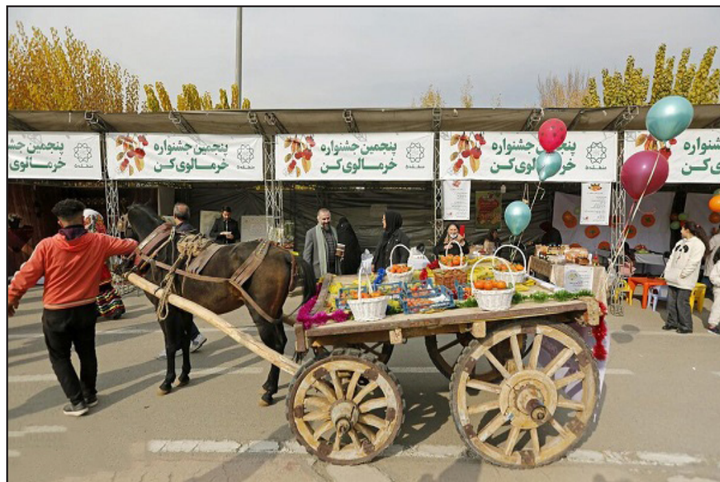
wonder that Tehran is one of Iran's most popular tourist destinations.

In addition to its rich history and vibrant arts scene, Tehran is also home to a number of parks and gardens that are perfect for exploring on a sunny day. With so much to see and do, it's no