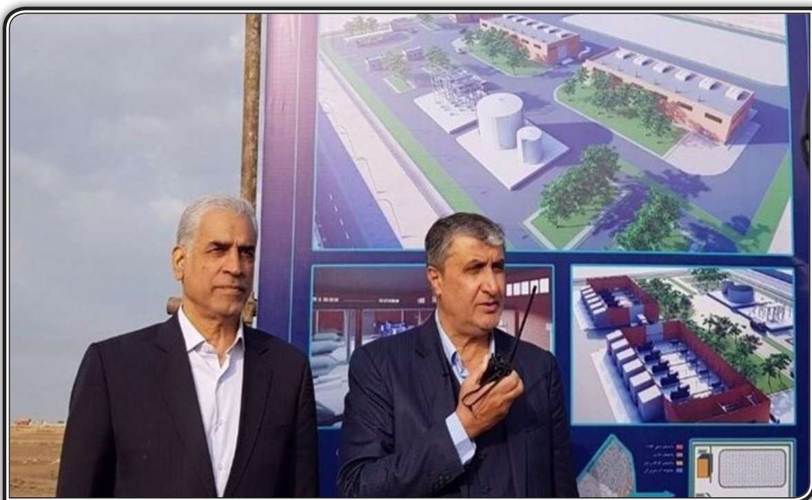
This photo shows head of the Atomic Energy Organization of Iran (AEOI) Muhammad Eslami (R) inaugurating construction on a nuclear power plant in Darkhovin.

TEHRAN -- Iran on Saturday began construction on a new nuclear power plant in the country's southwest, national TV announced, a day after the international nuclear agency said Tehran had tripled its capacity to enrich uranium to 60 percent purity.