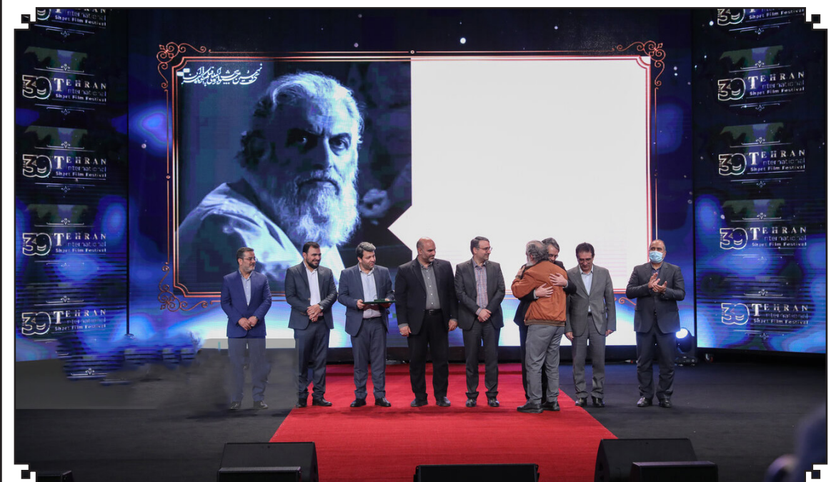
The closing ceremony of the 39th Tehran International Film Festival was held in Milad Tower in the presence of the Iranian Culture and Islamic Guidance Mohammad Mehdi Esmaeili.