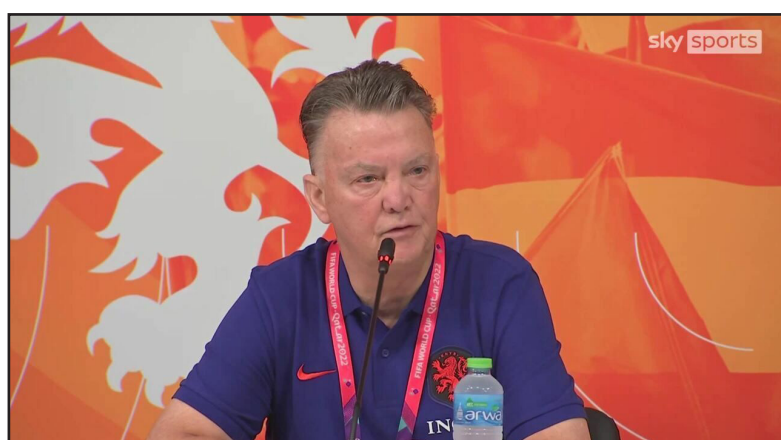
Netherlands coach Louis van Gaal

DOHA (Reuters) -- Netherlands coach Louis van Gaal has sounded a battle cry on the eve of his side's debut in the 2022 World Cup finals, saying he believes his side can lift the title that has always eluded them.