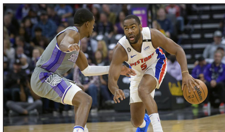
Detroit Pistons guard Alec Burks (5) is guarded by Sacramento Kings guard De'Aaron Fox during the first quarter of an NBA basketball game in Sacramento, Calif., Sunday, Nov. 20, 2022.

SACRAMENTO, Calif. (AP) — De'Aaron Fox had 33 points and seven assists and the Sacramento Kings extended their winning streak to six games with a 137-129 win over the Detroit Pistons on Sunday night.