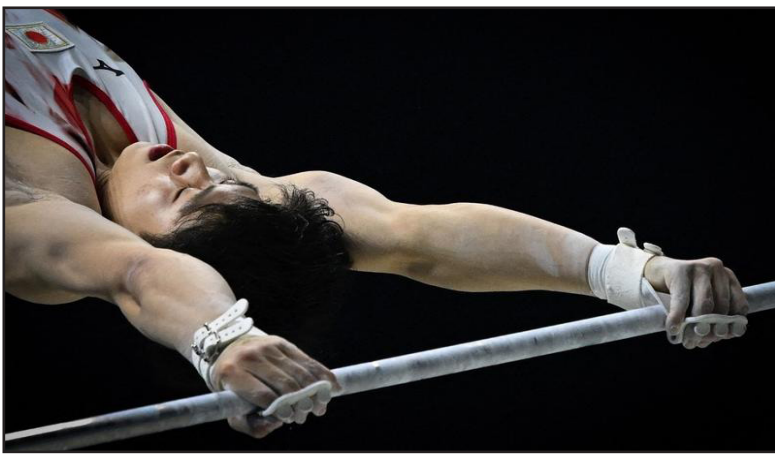
Japan's Daiki Hashimoto competes during the Horizontal Bars event of the Men's individual all-around final at the World Gymnastics Championships in Liverpool, northern England on Nov 4, 2022.

As they collected exactly the same scores on both vault and