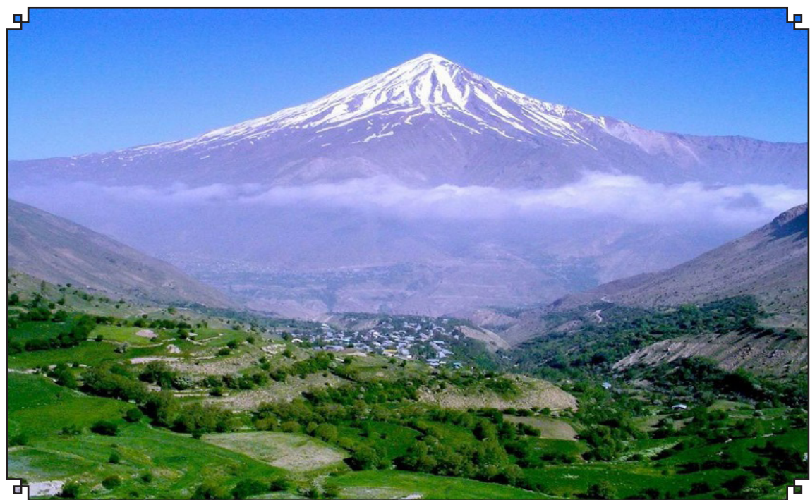
The Alborz mountain range is home to the loftiest mountains in Iran, dazzling its visitors with snowy peaks and numerous natural attractions.