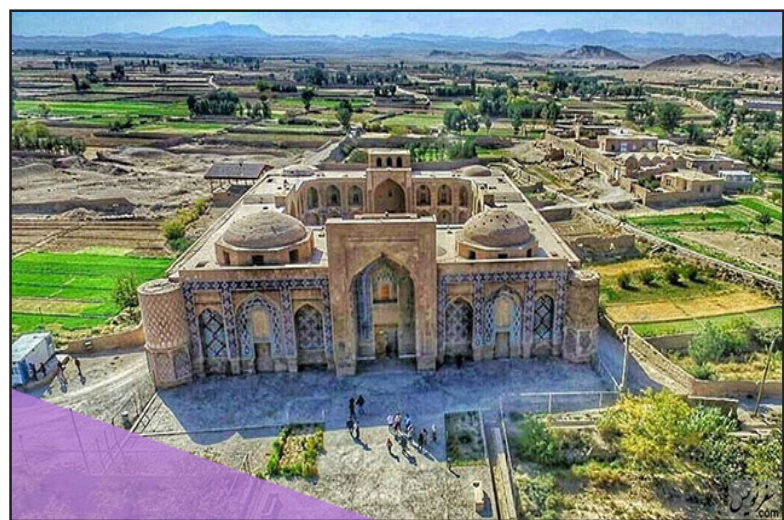
Ancient town of Khaf in northeast Iran’s Khorasan Razavi Province.

TEHRAN (IFILM) -- The ancient town of Khaf in northeast Iran’s Khorasan Razavi Province is regarded as an emerging destination for international travelers.