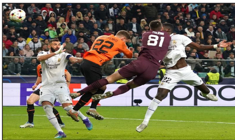
Real Madrid's German defender Antonio Rudiger (right) scores the 1-1 goal against Shakhtar Donetsk's Ukrainian goalkeeper Anatoliy Trubin (2nd right) and Shakhtar Donetsk's Ukrainian defender Mykola Matviyenko (3rd R) try to stop the ball during the UEFA Champions League group F football match Shakhtar Donetsk vs Real Madrid in Warsaw, Poland, on Oct 11, 2022.

After conceding a goal, the Spanish side speeded up their play to take the possession.