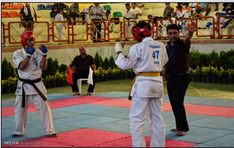
TEHRAN – Ahvaz will host the World Kyokushin Federation Budo (WKFB) international Karate tournament.

WKFB international Karate tournament will be hosted by Ahvaz, Iran on October 19-21, 2022, according to Iran Karate Federation (IKF).