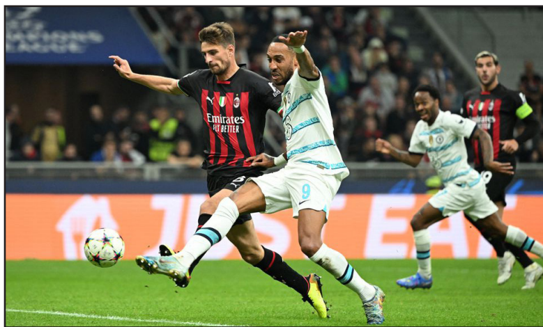
Milan's Matteo Gabbia in action with Chelsea's Pierre-Emerick Aubameyang

MILAN (Reuters) - Chelsea have completed the double over AC Milan to top Champions League Group E with a 2-0 victory at San Siro, a match the hosts had to play the majority of with 10 men.