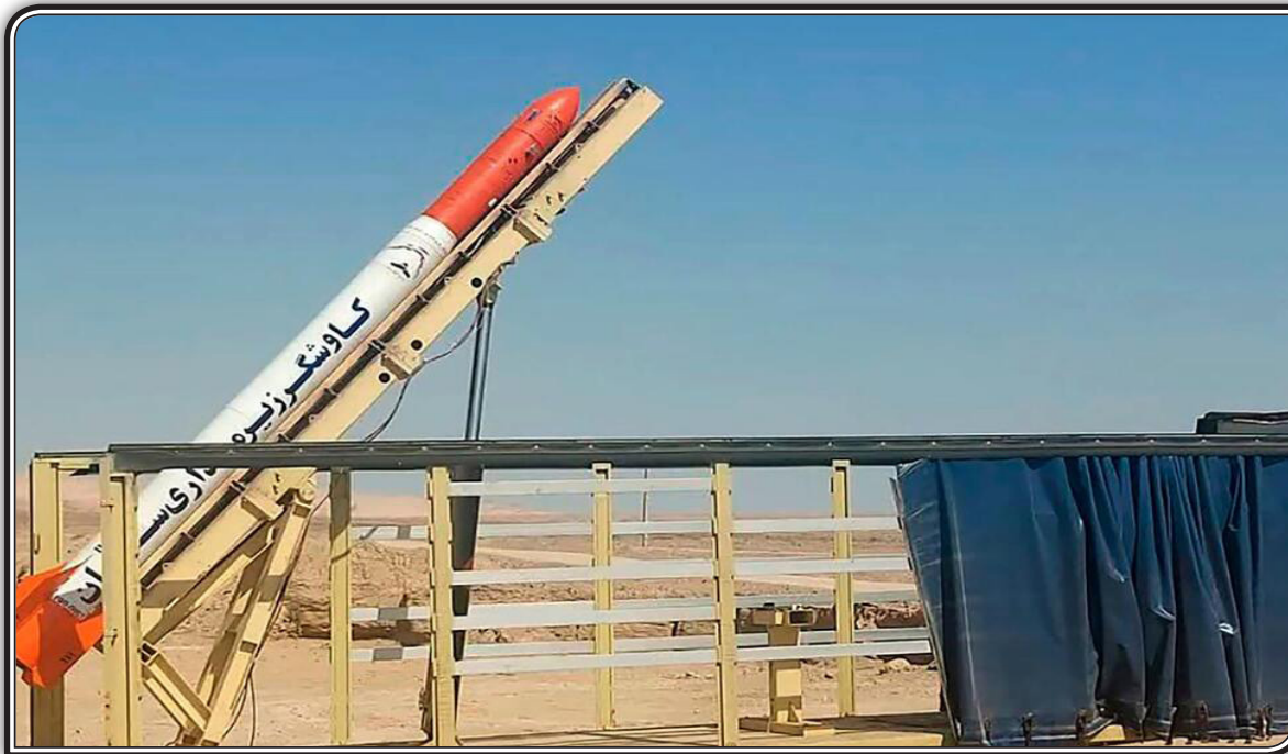
This picture released by the Iranian Defense Ministry on Oct. 4, 2022 shows a Saman test tug rocket before being launched in Iran.

TEHRAN — Iran has launched a space tug capable of shifting satellites between orbits, Tuesday reports said.