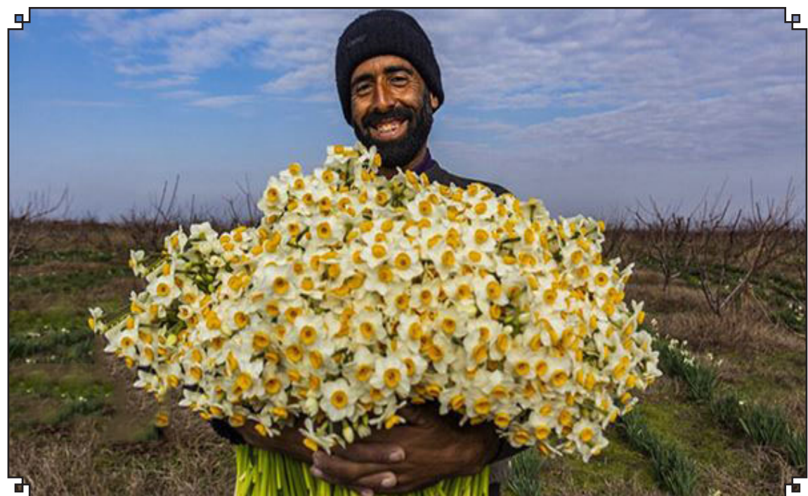
Two daffodil fields across the southern Iranian province of Fars have recently been inscribed on the national heritage list. The daffodil is a symbol for the eye in Persian culture and literature, notably the beloved's eye.