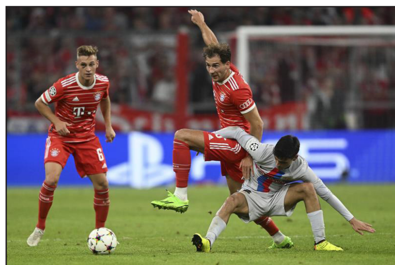
Barcelona's Pedri (right), Bayern's Leon Goretzka (centre) and Bayern's Joshua Kimmich in action during the Champions League, group C soccer match between Bayern Munich and Barcelona at the Allianz Arena in Munich, Germany on Sept 13, 2022

"We made six or seven big goal chances but missed them and Bay-