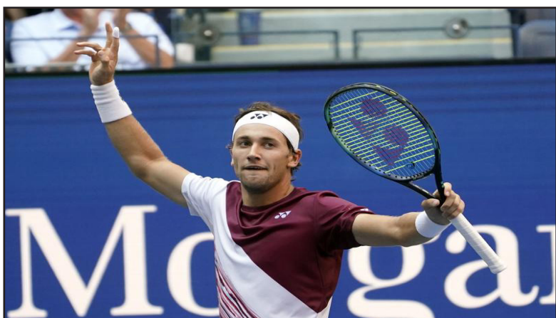
Casper Ruud, of Norway, celebrates winning the first set against Karen Khachanov, of Russia, during the semifinals of the U.S. Open tennis championships, Sept 9, 2022, in New York.

The fifth seed next faces either home hope Frances Tiafoe or third seed Carlos Alcaraz of Spain in the final.