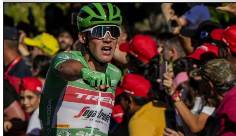
Denmark’s Mads Pedersen celebrates after winning the 19th stage of the Vuelta cycling race, in Talavera de la Reina, Spain, Sept 9, 2022.

MADRID (Reuters) -Denmark’s Mads Pedersen has dominated a bunch sprint to win stage 19 of the Vuelta a Espana in style—his third victory at this year’s race.