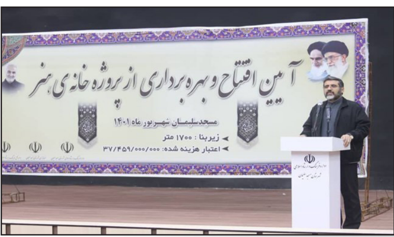
Minister of Culture and Islamic Guidance Mohammad-Mehdi Esmaeili.

With an infrastructure of 1,700 square meters, the art house has a meeting hall for 400 people, conference room, administrative and cultural rooms, prayer room, service and sanitary spaces.