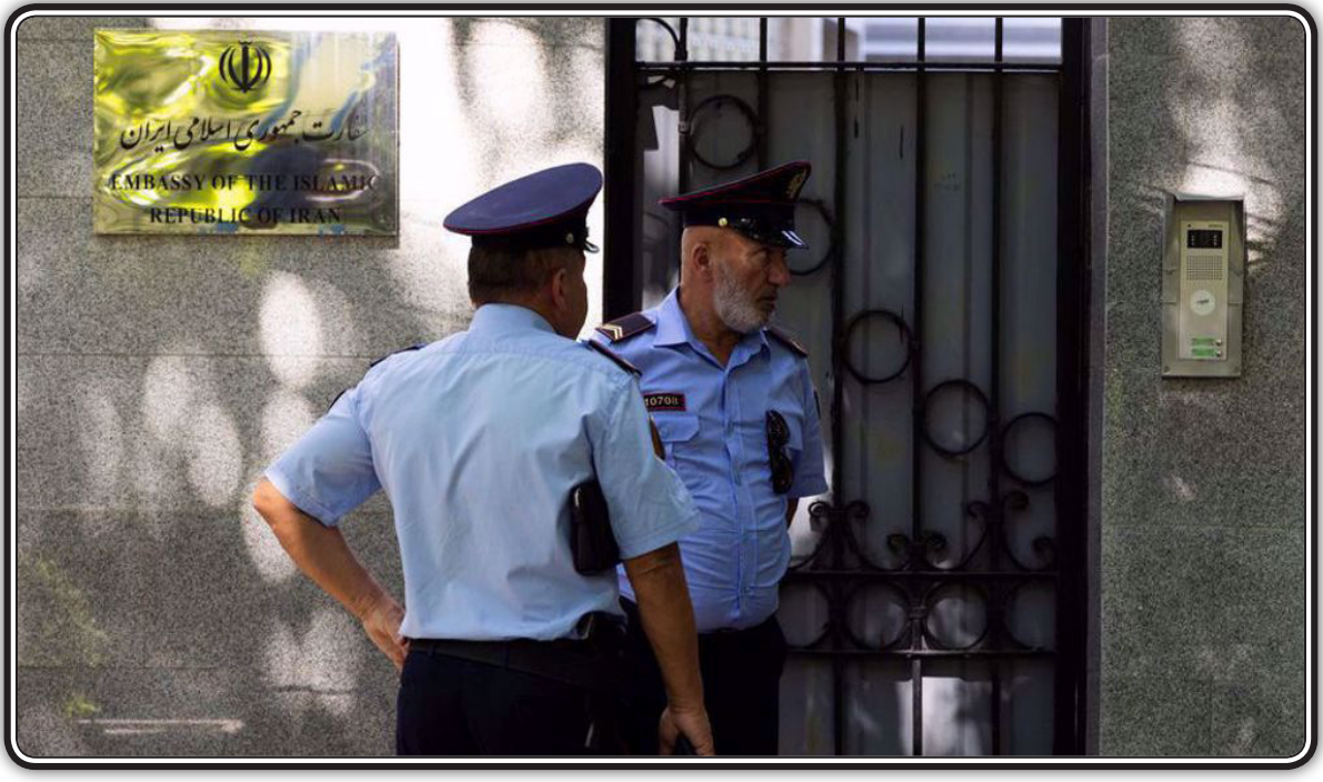
Albanian police officers stand in front of the Iranian embassy in Tirana on September 7, 2022.

TEHRAN -- Iran on Saturday strongly condemned a U.S. decision to impose sanctions on its intelligence ministry after baselessly accusing it of being behind a cyberattack on Albania.