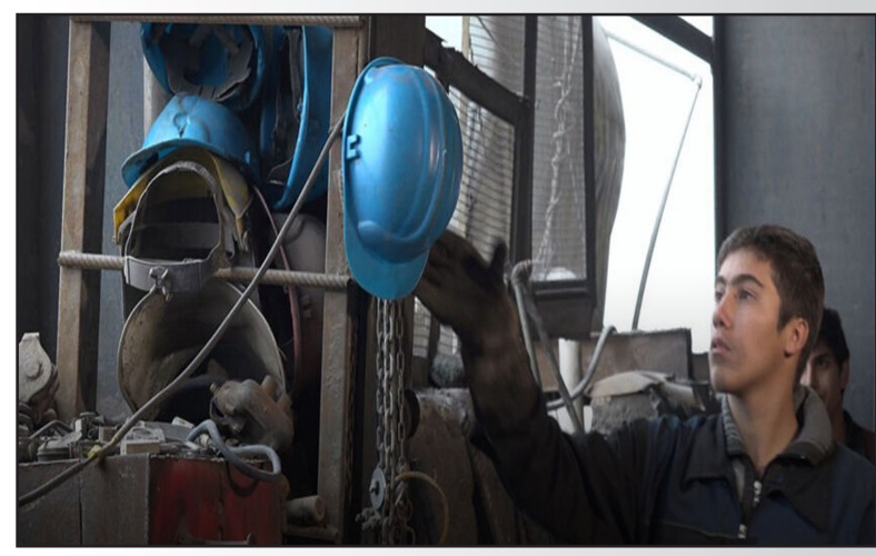
A still from Iranian film ‘The Reversed Path’ (The Contrary Route).

The upcoming edition of “Love is folly” will be held on August 26-September 4.