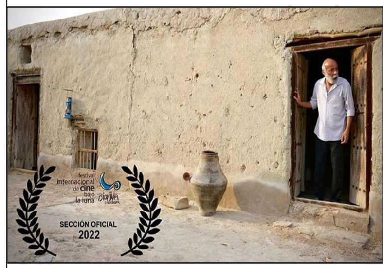
A scene from Iranian short film ‘Gold Wells’.