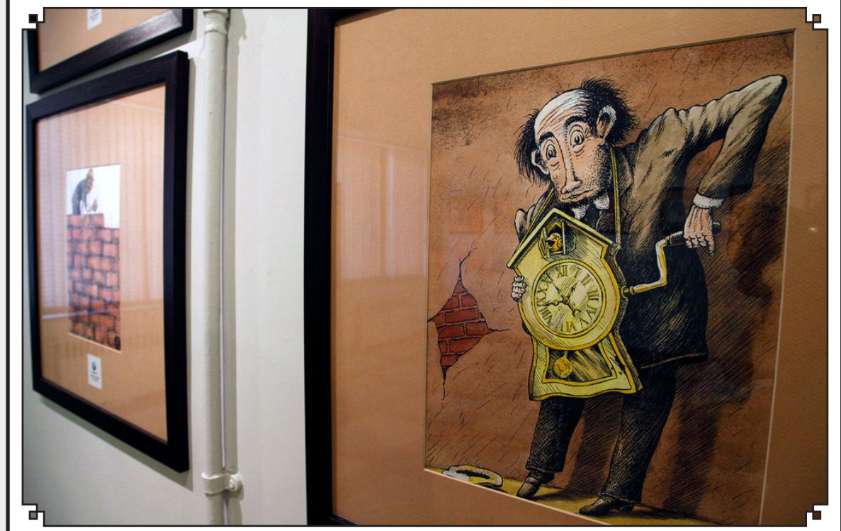
An exhibition reviewing the works of foreign cartoonists will be held at Iran Cartoon House until October 6.