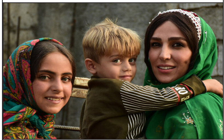
A still from Iranian feature ‘Wolf Cubs of Apple Valley’.

TEHRAN (IFILM) -- The Moscow International Film Festival (MIFF) in Russia has been scheduled to screen Iranian feature ‘Wolf Cubs of Apple Valley’.