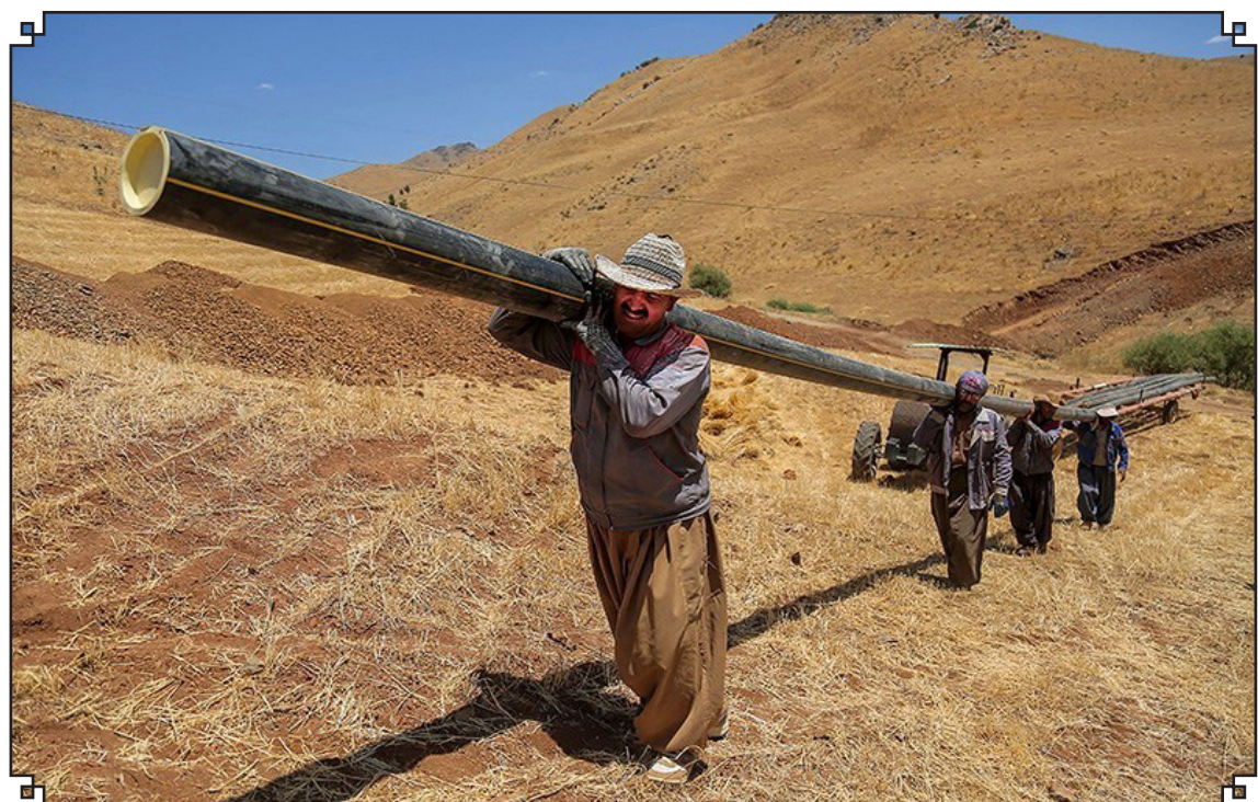
Local people carry pipelines on their shoulders in mountainous border regions in Marivan, Iran's Kordestan province for gas transfer to villages.