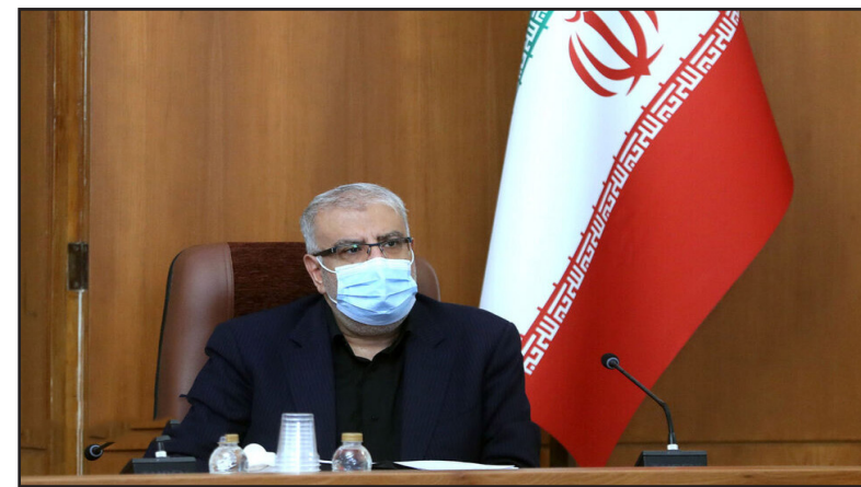
Iranian Petroleum Minister Javad Owji

"Undoubtedly, His Excellency's round-the-clock efforts as the OPEC Secretary General to promote solidarity and unity among