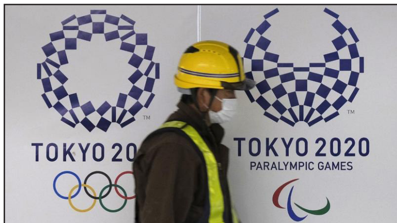
In this March 24, 2020 photo, a worker passes the logo of the Tokyo 2020 Olympic Games and Paralympic Games at a subway station in Tokyo.

TOKYO (AFP) - The final price tag for last year's Tokyo Olympics was more than double the city's original 2013 estimate after a one-year coronavirus postponement added to the already hefty bill.