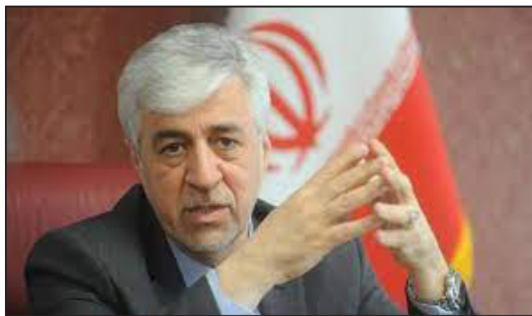
Iranian Sports and Youth Affairs Minister Hamid Sajjadi

TEHRAN – The Sports and Youth Affairs Minister Hamid Sajjadi has left Iran for Azerbaijan to attend the upcoming meeting of the OIC Permanent Council of Conference of Ministers of Youth.