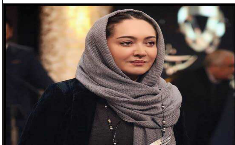
Iranian actress, producer, director, and screenwriter Niki Karimi.

TEHRAN (Honaronline) - Iranian actress, producer, director, and screenwriter Niki Karimi has been selected as the jury member of the International Narrative Feature Competition section at the 2022 Tribeca Festival in U.S.A.