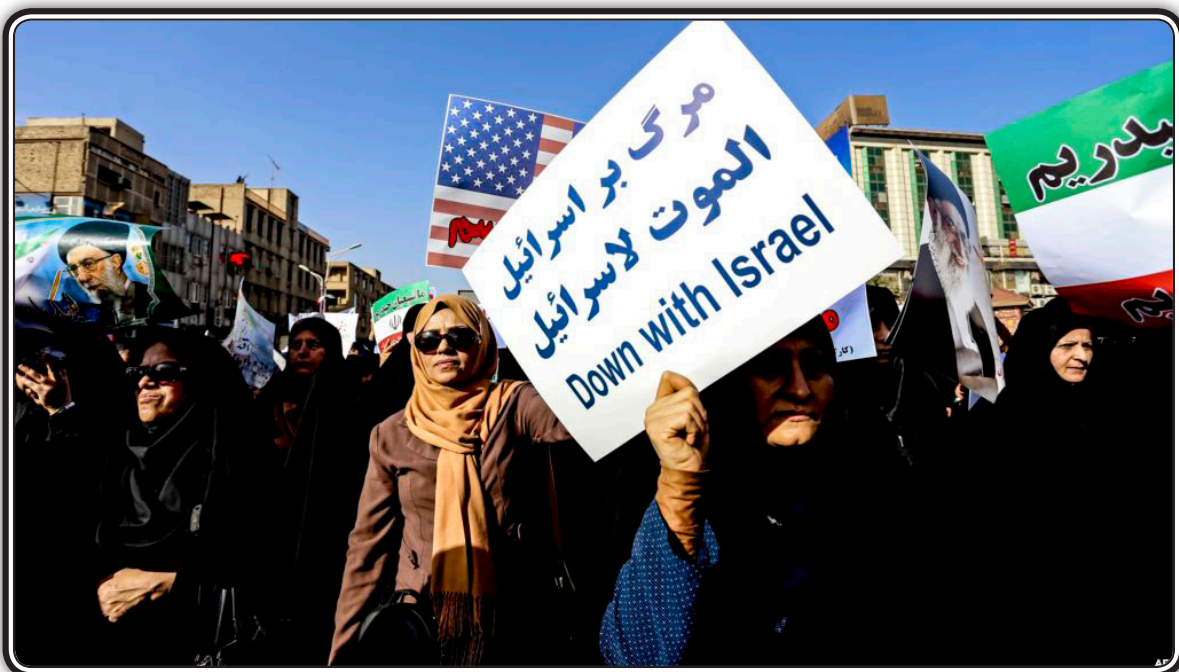
Iranians hold placards supporting Palestine during a rally in Tehran in this file photo.

TEHRAN – Islamic Jihad head Ziad al-Nakhala says Imam Khomeini's movement gave meaning to the lives of Muslims worldwide and that only the Islamic Republic founded in Iran stands firm in supporting the Palestinian cause.