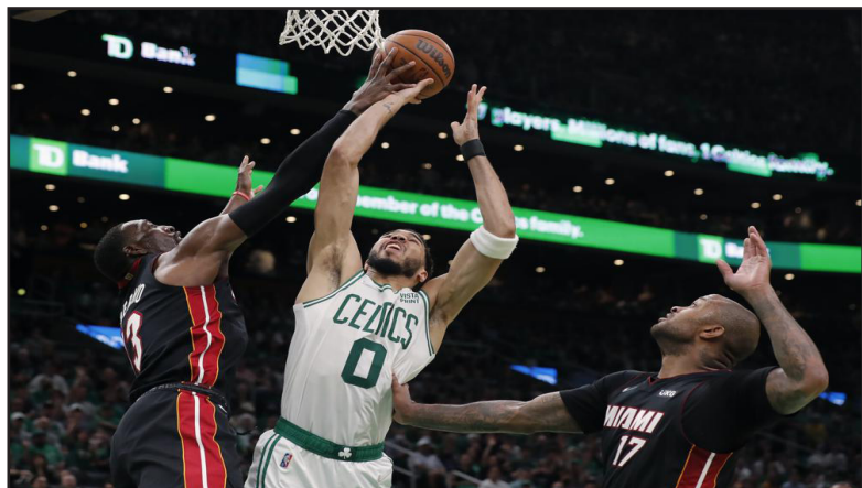
Miami Heat's Bam Adebayo, left, blocks a shot by Boston Celtics' Jayson Tatum (0) during the second half of Game 3 of the NBA basketball playoffs Eastern Conference finals Saturday, May 21, 2022, in Boston.

The Celtics never led, but they cut a 46-20 deficit to one