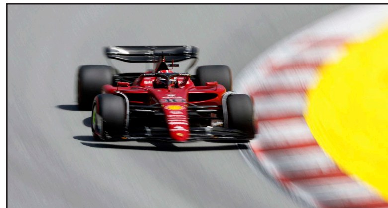
Ferrari's Charles Leclerc in action during the race at Spanish Grand Prix - Circuit de Barcelona-Catalunya, May 22, 2022.

MONTMELÓ, Spain (AP) — Max Verstappen reclaimed the Formula One points lead as the reigning world champion won the Spanish Grand Prix on Sunday for his third consecutive victory after