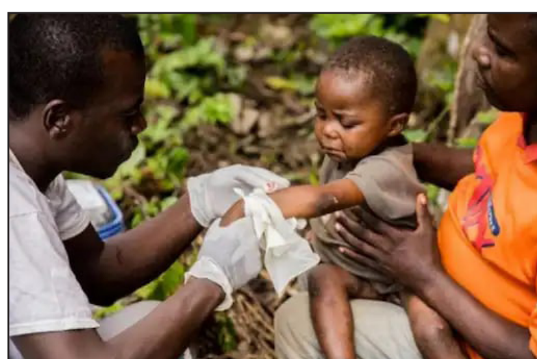
A child affected by monkeypox, sits on his father's legs while receiving treatment at the center of the International medical NGO Doctors Without Borders, in Zomea Kaka, in the Lobaya region, the Democratic Republic of the Congo.