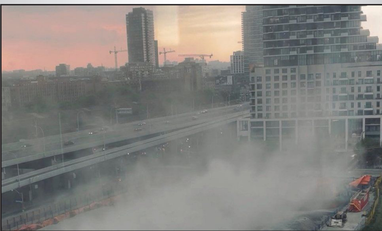
A dust cloud swirls in Toronto on Saturday in this screengrab obtained from a social media video.

ONTARIO (Al Jazeera) – Four people are dead and nearly one million homes are without power after severe storms pummeled the eastern Canadian provinces of Ontario and Quebec. Ontario police said three people died and several more were injured because of the strong thunderstorm. Images posted on social media from across the province showed debris-strewn streets and toppled trees that damaged homes and cars. One man was killed when a tree fell on the trailer he was staying in on Saturday. Meanwhile, according to Peel Regional Police, a woman in her 70s was killed after being struck by a tree in the city of Brampton. "Woman was transported to local hospital where she succumbed to her injuries," the organization posted on Twitter. The storm was severe enough for Environment Canada to issue broadcast-intrusive emergency alerts that went out to television and radio stations and mobile phones. In the federal capital Ottawa, another person was killed by the storm, but local police declined to give further details. The fourth victim was a woman in her 50s. She drowned when her boat capsized in the Ottawa River, which separates