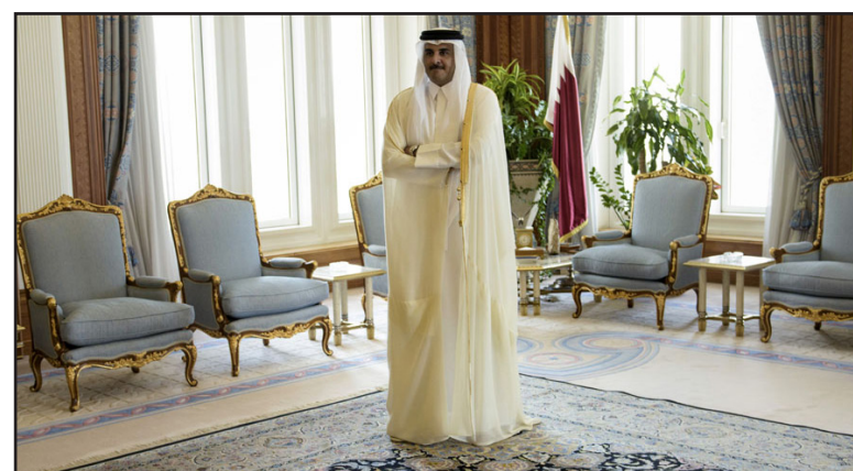
Qatari Emir Tamim bin Hamad al-Thani stands in his office ornamented with Persian rugs in this file photo.