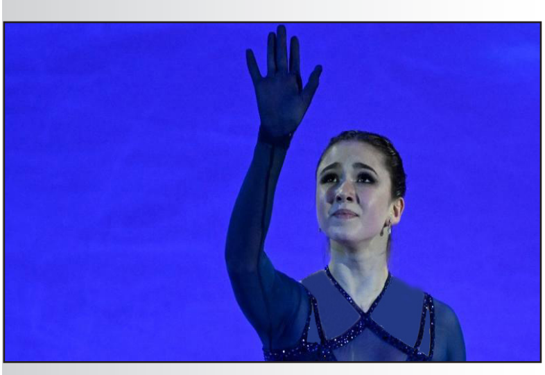
In this file photograph taken on Feb 14, 2023 Russia's figure skater Kamila Valieva takes part in a show at the CSKA arena in Moscow.

LONDON (Reuters) - The Russian Anti-Doping Agency (RUSADA) has performed an about-turn in the case of Kamila Valieva and asked the Court of Arbitration for Sport (CAS) to sanction the figure skater and set aside a ruling from RUSADA's own disciplinary tribunal.