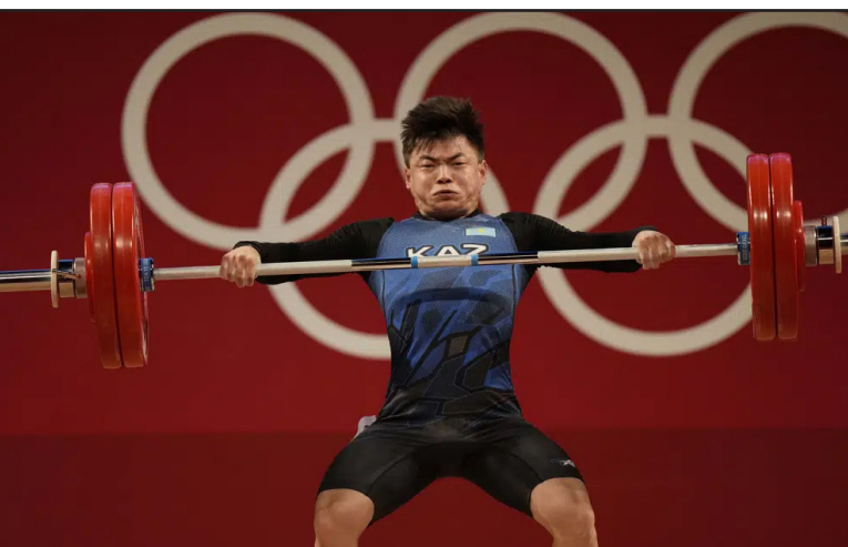
FILE - Igor Son of Kazakhstan competes in the men's 61kg weightlifting event, at the 2020 Summer Olympics, on July 25, 2021, in Tokyo, Japan.

test would not lead to Son being stripped of his Olympic medal.