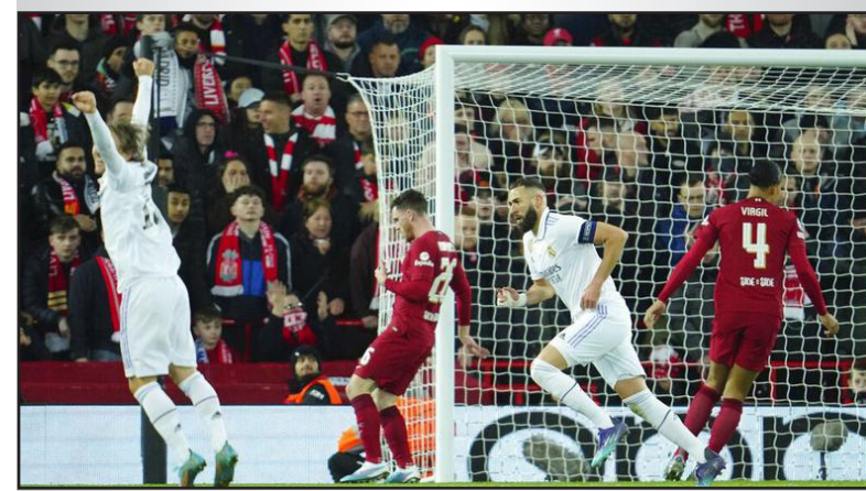
Real Madrid's Karim Benzema (second right) celebrates after scoring his side's fifth goal during the Champions League, round of 16, first leg soccer match between Liverpool and Real Madrid at the Anfield stadium in Liverpool, England, on Feb 21, 2023.

LIVERPOOL (Reuters) - Holders Real Madrid produced a stunning comeback from two goals down to earn a devastating 5-2 victory at a shell-shocked Liverpool in the first leg of their Champions League last-16 tie.