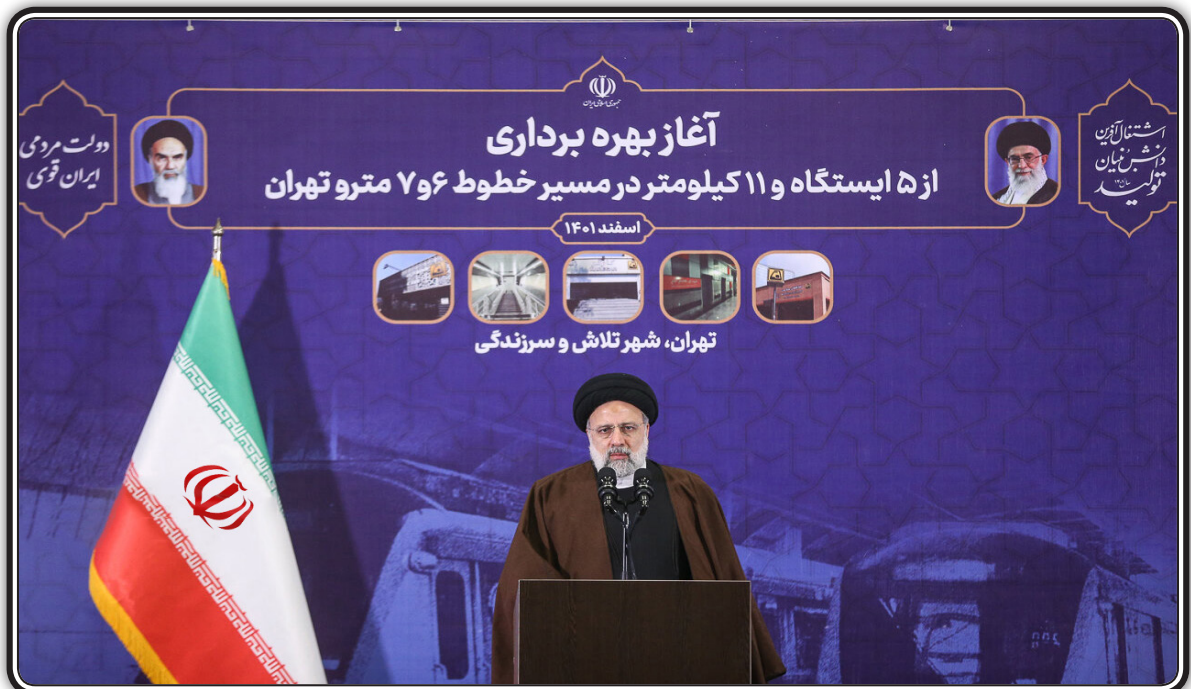
President Raisi addresses an official ceremony to inaugurate the launch of several new urban railway routes in Tehran Saturday.

TEHRAN -- President Ebrahim Raisi on Saturday lauded Iran's achievements and progressive movement over the years, saying the enemies seek to induce despair among the people and turn the country's strengths into weaknesses.