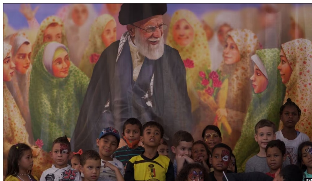
Venezuelan children gather in front of a poster of Leader of the Islamic Revolution Ayatollah Seyyed Ali Khamenei at the International Fair of Venezuelan-Iranian Culture and Friendship in Caracas, March 2023.

The Venezuelan vice-president said the mental proximity of the two nations and their shared view-