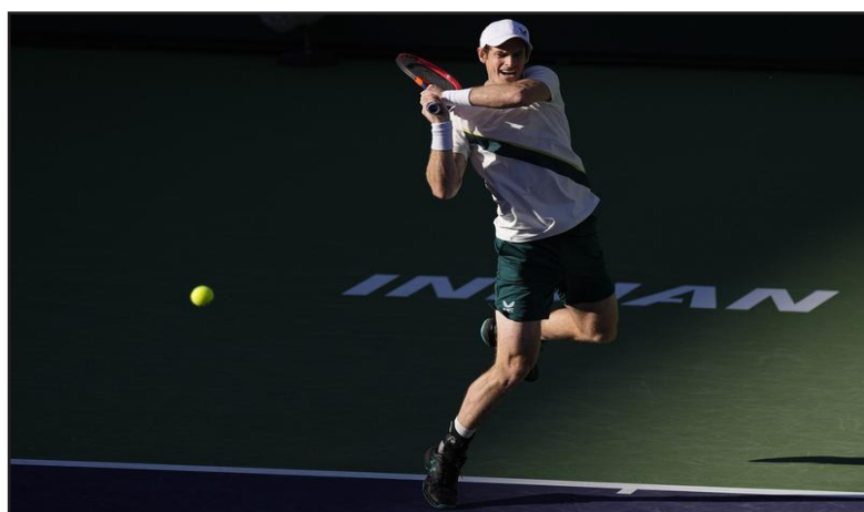
Andy Murray, of Britain, returns a shot to Tomas Etcheverry (not in photograph), of Argentina, at the BNP Paribas Open tennis tournament on March 9, 2023, in Indian Wells, California.

PARIS (AFP) - Murray dropped the tight first set and frustration with his play and some of the calls made by the electronic line calling system threatened to boil over.