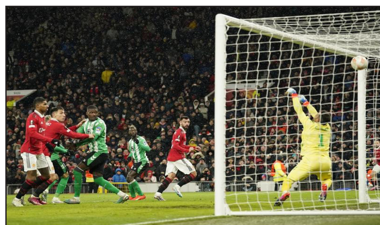
Manchester United's Bruno Fernandes (center) scores his side's third goal during the Europa League round of 16 first leg soccer match between Manchester United and Real Betis at the Old Trafford stadium in Manchester, on March 9, 2023.

Six minutes later, Fernandes shrugged off the scathing criticism he received as captain after Sunday's poor performance with a goal to head in a corner off the fingertips