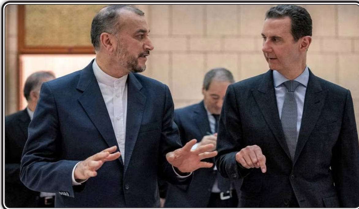
Iran's Foreign Minister Hussein Amir-Abdollahian (L) and Syrian President Bashar al-Assad talk in Damascus, March 9, 2023.

DAMASCUS (Dispatches) -- Iranian Foreign Minister Hussein Amir-Abdollahian has met Syrian leaders, including President Bashar al-Assad, reiterating Tehran's support for Damascus and condemning repeated Israeli acts of aggression against the Arab country.