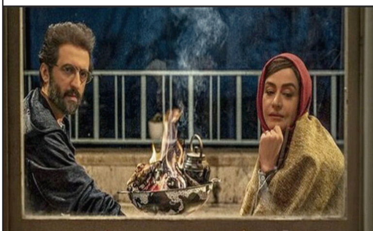
TEHRAN -- Iranian feature 'Henas' has won an award at the Accolade Global Film Competition in the U.S.