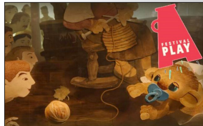
The 10th edition of the festival is taking place in São Jorge Cinema and Cinemateca Jr

Festival PLAY is an event totally dedicated to children and young people. It shows the best films in short, medium or long feature formats.