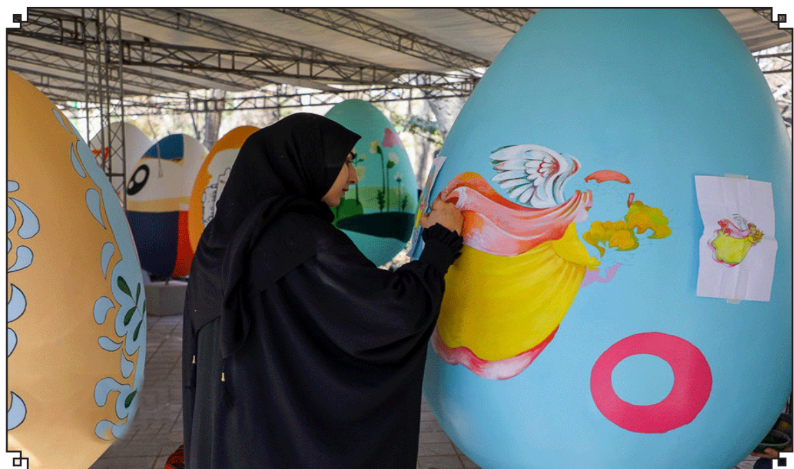
Just a few days prior to the Persian New Year or Nowruz, streets in Tehran are hosting giant colored eggs. The colored eggs festival kicked off on March 4 in the presence of 278 artists in Tehran. The artworks will be displayed in various districts of the city.