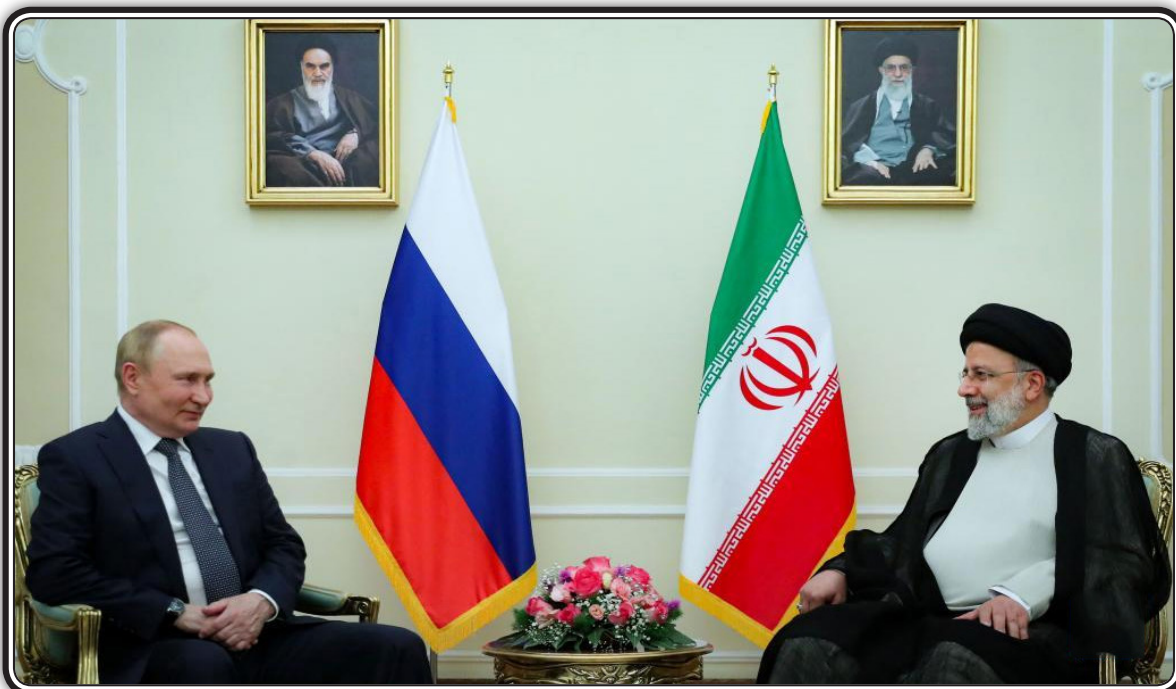
President Ebrahim Raisi (R) meets with Russian President Vladimir Putin in Tehran on July 19, 2022.

TEHRAN – Iranian President Ebrahim Raisi and his Russian counterpart Vladimir Putin on Monday discussed possible ways to strengthen economic cooperation, particularly in the field of international transit, as well as joint infrastructure projects.