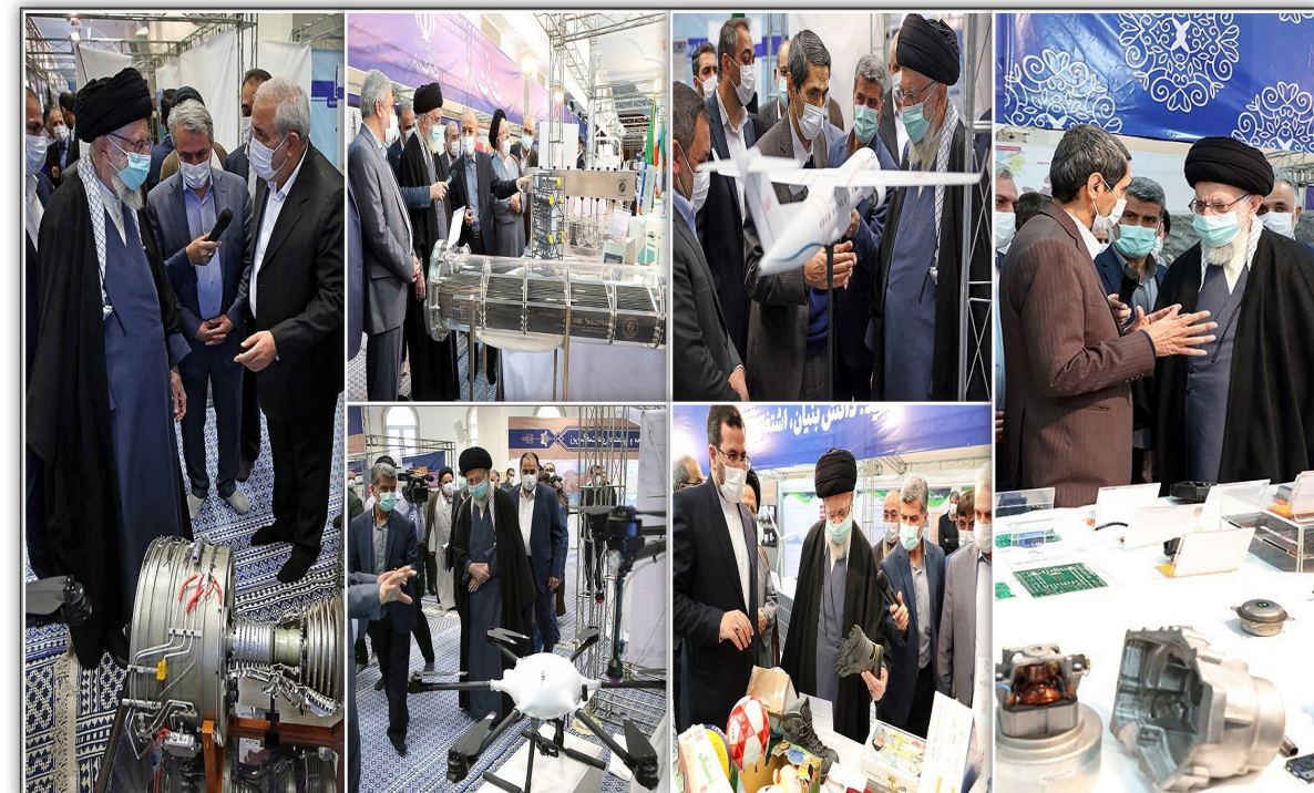
This combination of pictures shows Ayatollah Khamenei visiting an exhibition of Iranian-made technological and knowledge-based products in Tehran Saturday.

TEHRAN -- Leader of the Islamic Revolution Ayatollah Seyyed Ali Khamenei on Saturday visited an exhibition where Iranian-made technological and knowledge-based products are on display.