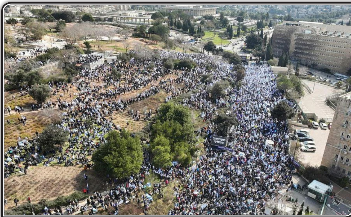
Protesters gather outside the Knesset to vent anger at the extremist direction of the occupying regime of Israel.

TEL AVIV (Dispatches) – Hundreds of demonstrators took to the streets in Al-Quds for the seventh consecutive week Sunday to protest against the current Zionist regime's plans to extremely harden judicial laws.