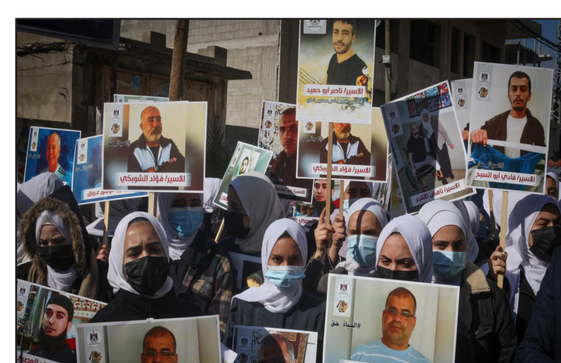
A rally in support of Palestinian prisoners in the Zionist regime's jails, outside the International Committee of the Red Cross building in Gaza City on 14 February 2022

"This strike, bearing the banner of freedom or martyrdom, is a strike that will be undergone by every capable prisoner regardless