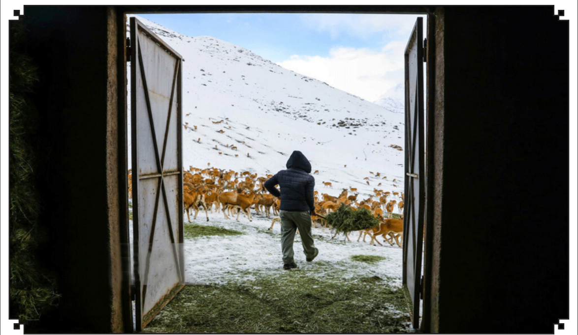
With the first snowfall, when the green of the Vargin of Lavasanat Mountains turns to white, a journey begins. Rams and ewes reach the mountainside in groups from the top of the peaks; in search of food, for survival. They descend slowly through the stones and rocks. As they get closer and closer to the city, humans arrive to help and give food.