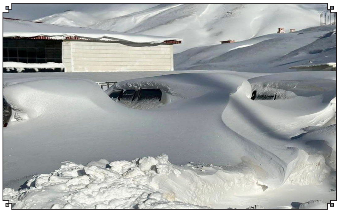
Cars are buried under heavy snow in Iranian province of West Azarbaijan. Heavy snowfalls have recently blanketed many parts of the country.