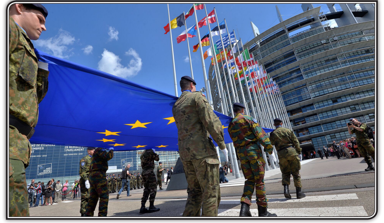
Soldiers of a Eurocorps detachment carry the European Union flag to mark the inaugural European Parliament session on June 30, 2014, in front of the European Parliament in Strasbourg, eastern France.

TEHRAN – Iran on Sunday warned the European Union it would take "reciprocal" measures after the European Parliament voted to list the Islamic Revolution Guards Corps (IRGC) as a terrorist group.