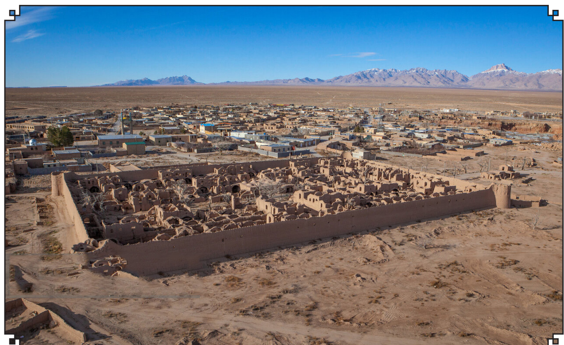
Located in Mehriz County in Yazd Province of Iran, Ernan castle dates back to the Qajar era and its architectural style is unique.