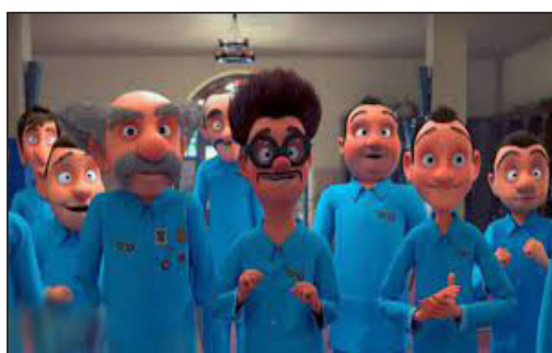
A still from Iranian animation 'Loupetoo'.

TEHRAN (IFILM) – Iranian animation 'Loupetoo' has made its way to the Kids First Film Festival in the United States.