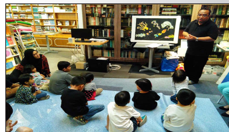
"Carle once said that picture books are an introduction to literature for the very young reader. I hope to be able to encourage children to see how wonderful it is to be surrounded and touched by books,"

The American author and illustrator, Eric Carle, is his favorite.